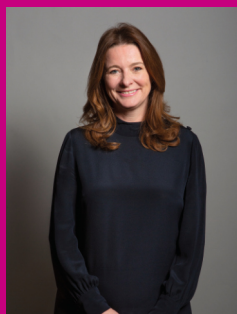
Gillian Keegan MP

During National Apprenticeship Week 2021, we officially launched We invest in apprentices.